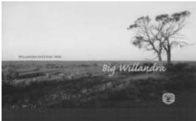
Front cover of the Willandra NP booklet. A copy of the booklet is included in the accompanying blue folder to this report.