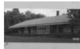
Strip of photos from Big Willandra booklet 'Pastoral Pleasures' 6/7

The other place to find historical interpretation at Willandra National Park is inside the homestead. This is predominantly through the framed photos and captions to be found in each room, and a series of stories in folders available to be read in the sitting room. The front door remains open for visitors to the Park and the homestead is available for overnight accommodation, catering for couples and families to large groups. The rooms have been elegantly refurbished in period style except for the kitchen, somewhat to the chagrin of women who once cooked there, which has been modernised to cater for guests. 233 Rather than a museum therefore, the homestead has been successfully renovated as a functioning living space.