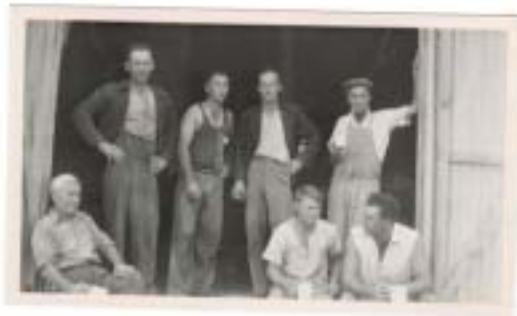
The Shearing team at Leaghur, c.1955.