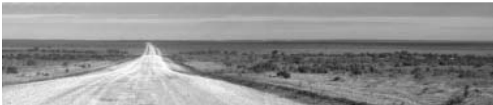
Approach towards the Mungo sand hills (in the far distance on the left) from Ivanhoe.

As a consequence of this I was unable to access the site-specific resources needed and no detailed on-site interpretation work was completed for this report. I concentrated on the interviews and the local research on the region that I had planned to do so as to produce the 'regional history' aspect of the project brief. This work has informed section two, and earlier and following parts of this section. 265