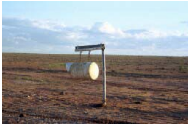
On the Hillston to Mossgiel Road, about half way between Willandra and Coorain

The journey suddenly changed from travelling by green pastures and a modern atmosphere, to rarely seeing an inhabited building, or a living tree... Relief passed through everyone at the sight of the sign: 'Willandra National Park 20 km'. Then buildings appeared: shearing sheds, the cottage, the homestead and finally, the Men's Quarters... our home for the next five days. 210