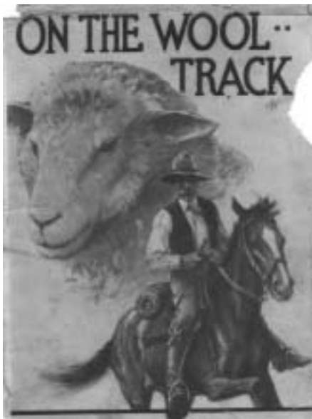
Cover of the 1916 edition

Bean's On the Wool Track was first published in 1910. By then a journalist, the career that would make him so famous as Australia's First World War correspondent, he was given the task of writing about the wool industry. 114 His style makes for engaging and often empathetic reading that provides insights into particular-remote-life ways as well as dominant discourses of his day. His opening chapter foreshadows aspects of western NSW history writing throughout much of the twentieth century.