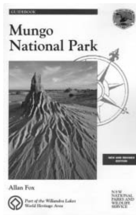
The most recent designs for Willandra and Mungo National Parks brochure and guide book (May2003)

Mungo National Park, on the other hand, has until recently eschewed its settler history. Its international reputation is built on the archaeological discoveries made from the late 1960s of ancient Aboriginal remains, set within the arresting ‘lunar’ landscape known as the Walls of China. In 1979 the park was proclaimed after purchasing Mungo Station the previous year, becoming the centre of the Willandra Lakes World Heritage area declared in 1981.