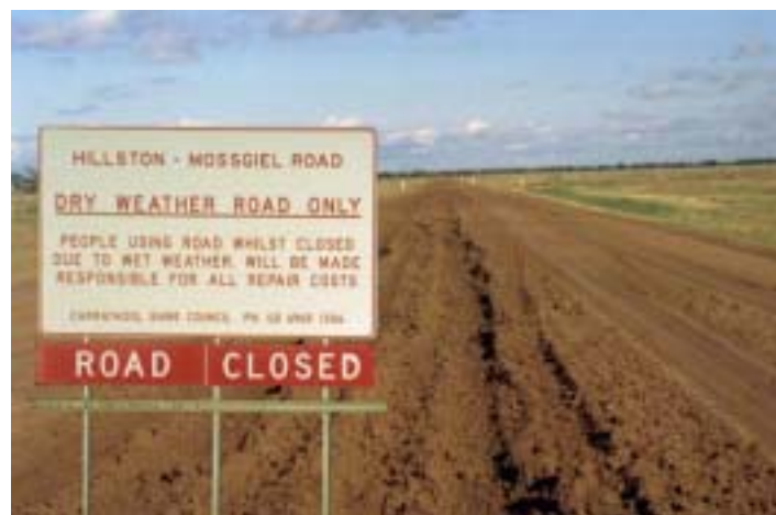
Composite photo by Rod Sims of two photos of the Hillston to Mossgiel Road, late afternoon, 18 th May 2003.

..... 18/5/03: 8pm Sunday evening and I'm in Ivanhoe. Not on the itinerary! Yesterday the mist cleared earlier – about 3pm. But we all expected a clear night and were hopeful of no mists this morning. No mist - instead it rained! That wasn't meant to happen. There were some very grey faces on the school group. However the skies cleared to cloudless blue by late morning and the wind blew up – and by 4pm everyone was suddenly clearing out. Even Ross... Once I was on the 'main road' Susie told me not to worry – I'd see a thin silver track in the sun that would guide my way along the churned up road. Not to worry which side of the road it took – just follow it. And, Ross said, if a bigger vehicle than you approaches from the other way – make them get off the road (yeah right!). Not that I had to worry – I only met sheep... Ross drove the school bus out to the main road, where they turned left, and as I came out later to turn right onto the lonely Hillston to Mossgiel road I saw him returning. We said our goodbyes and then he cheerfully added – 'remember it's a closed road so make sure you don't damage the vehicle'. Thanks Ross.