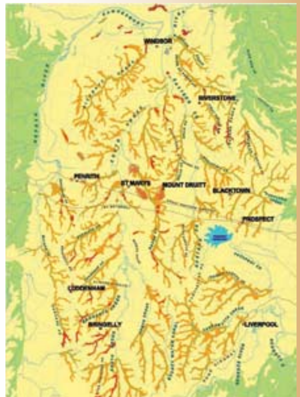
Draft Salinity Hazard Map for Western Sydney