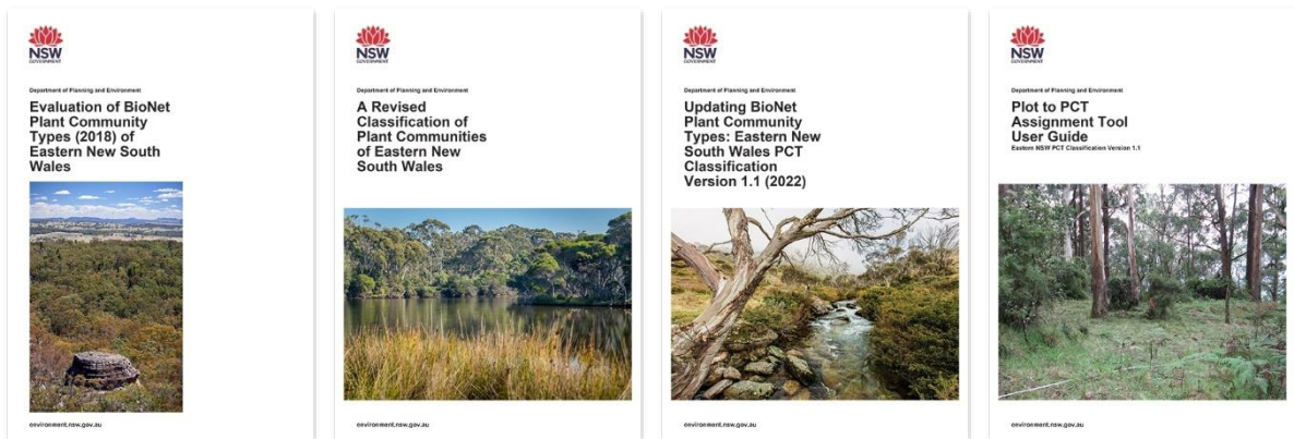
Figure 2 Project reports in this series

This report is one of a series of 4 describing the context, methods and results, implementation steps and new tools arising from recent vegetation classification work in eastern NSW. Report 1 (DPE 2022a) evaluates the set of Approved PCTs in eastern NSW as at 1 November 2018. It identifies strengths and weaknesses with the PCTs and proposes steps for improvements. Report 2 (DPE 2022b) is a detailed technical document describing the methods applied to the development of a new plot-based classification for eastern NSW and concluding with the identification of 1,067 coast and tablelands groups (ENSW v1.1 groups) and 138 western slopes groups. Report 3 (this report) describes the assessment and adoption of the ENSW v1.1 groups into the PCT master list. Report 4 (DPE 2022c) describes a new online identification tool that enables users to identify PCTs in the coast and tablelands bioregions using standard floristic survey plots.