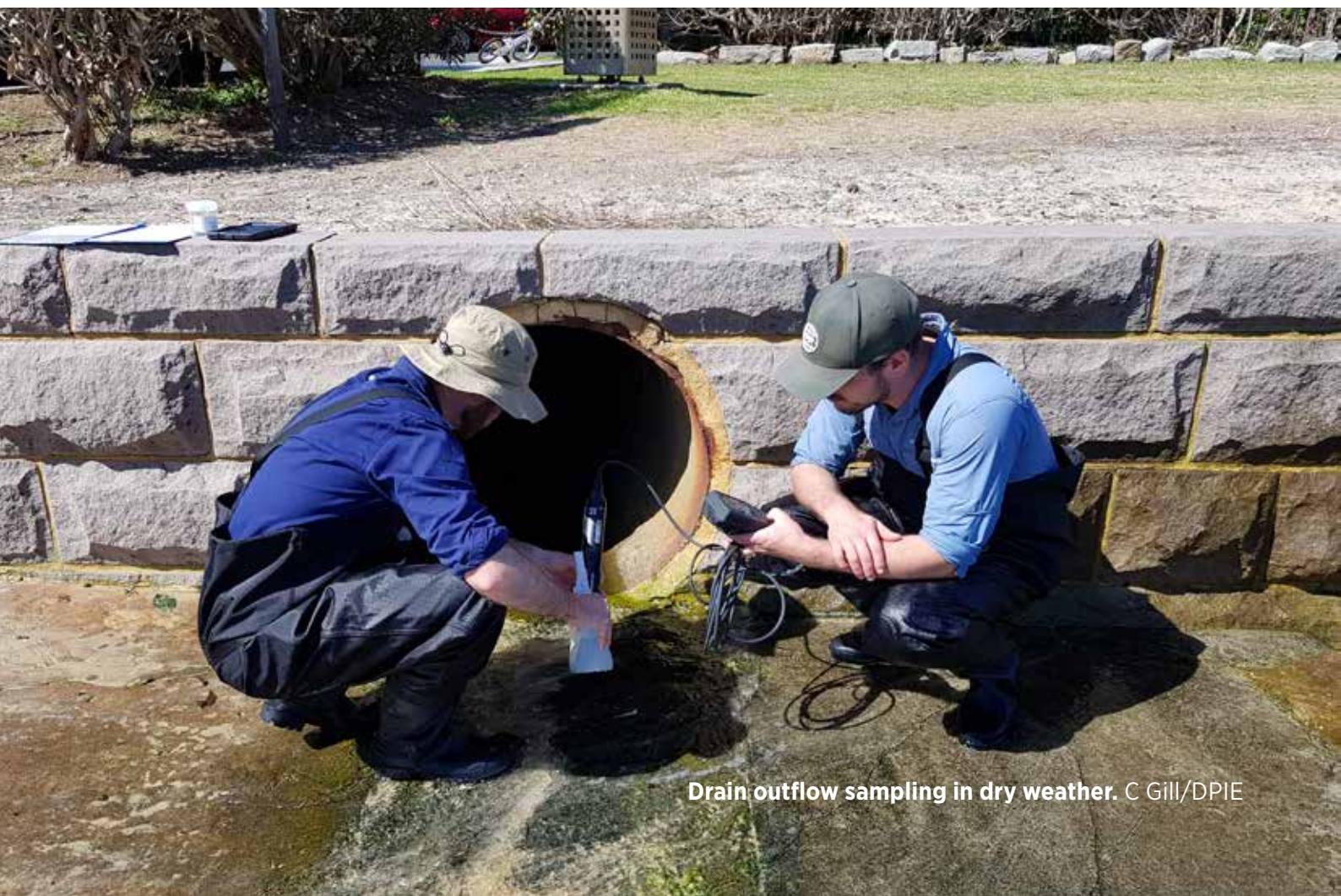
Drain outflow sampling in dry weather.

Water quality in Rose Bay is generally suitable for swimming in dry weather conditions. After rain, microbe levels in swimming waters increase, but poor water quality is largely confined to nearshore areas, particularly near stormwater outlets. Microbes return to safe levels a few days after the rain stops.