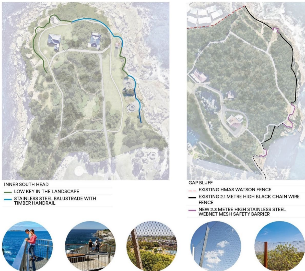
Figure 9 Fencing strategy

The proposed site-wide fencing strategy was well received by the community with most respondents in support of it.