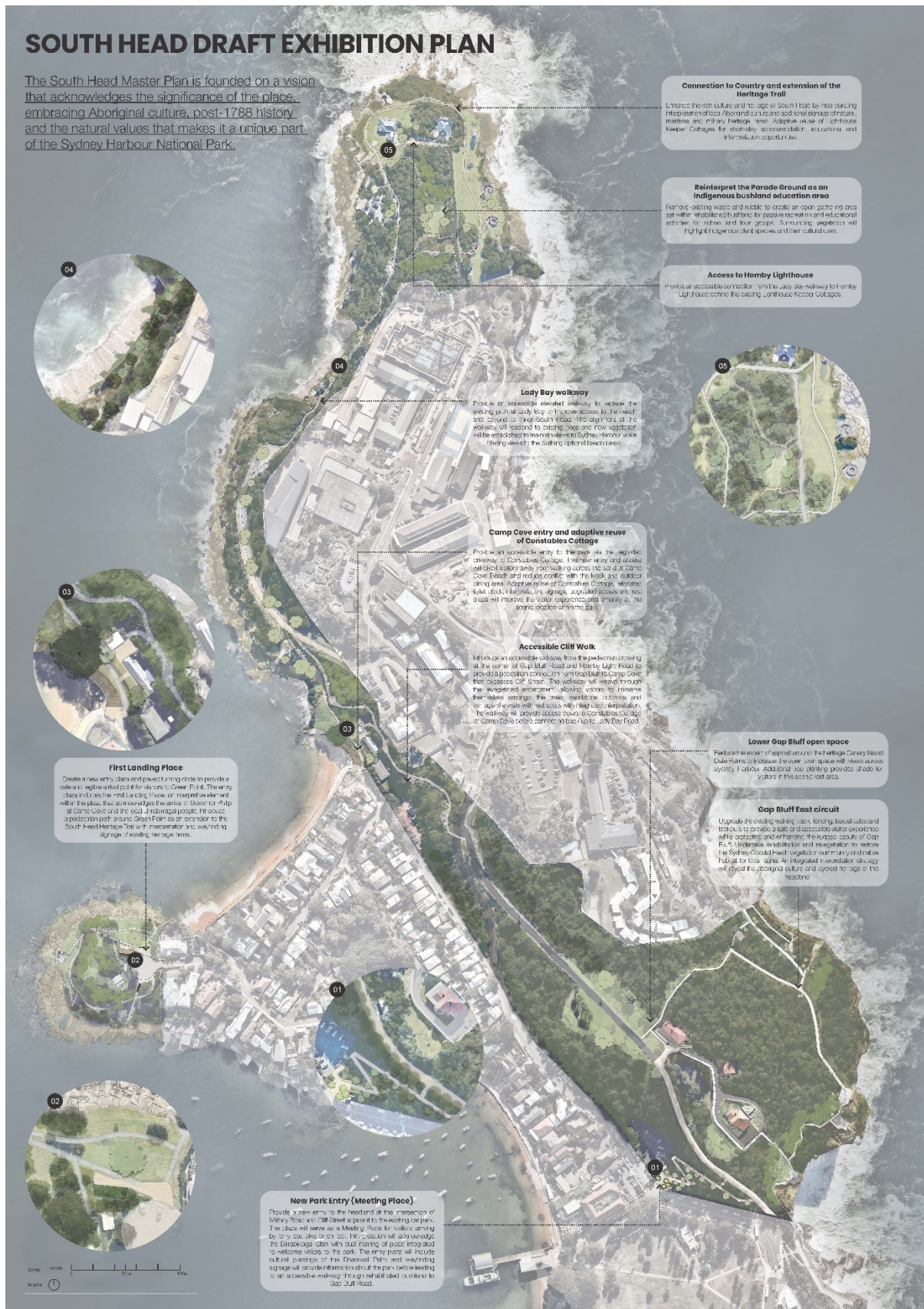
Figure 3 Exhibition display board for the draft master plan