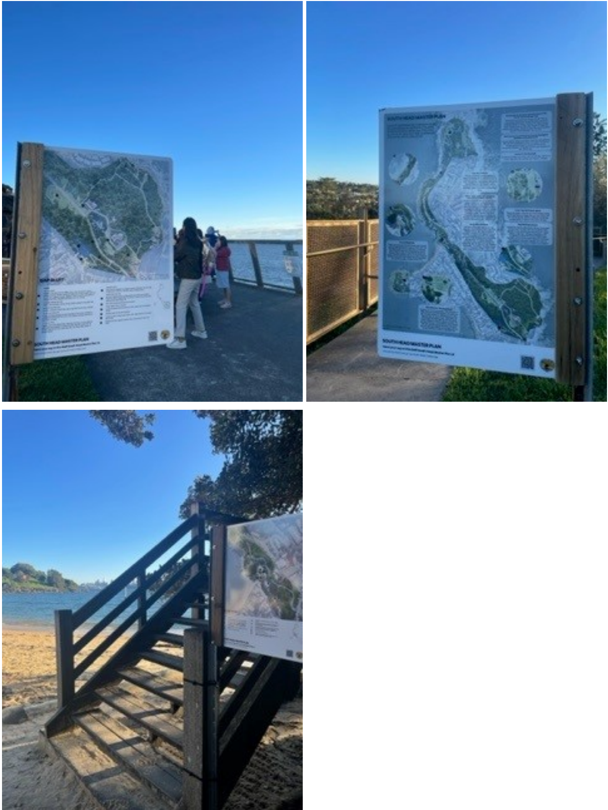
Figure 1 Draft master plan exhibition boards at Gap Bluff, Inner South Head and Camp Cove