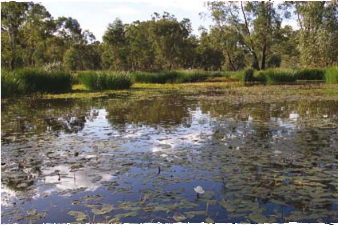
Many wetlands, including Lowbidgee Wetlands, are protected in national parks and reserves.