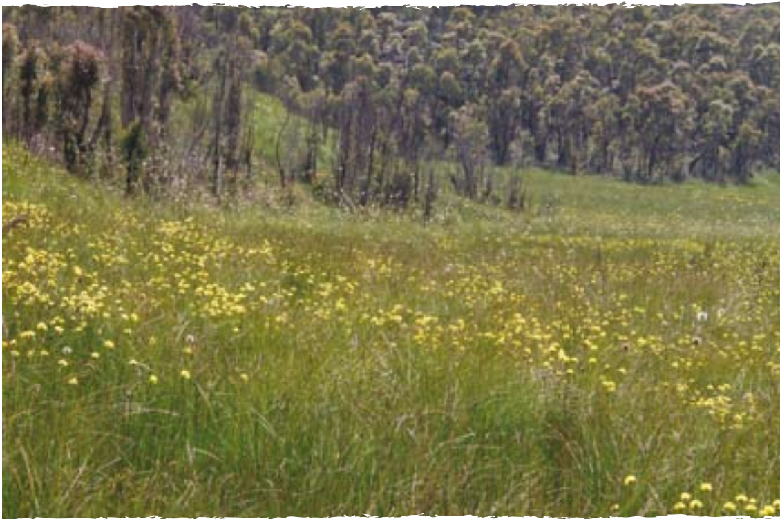
Upland wetlands, such as Mt Hay Creek swamp in the Blue Mountains region, provide habitat for a wide range of plants such as this flowering buttongrass.

The other major type of wetland in NSW is the upland wetland. This type of wetland is located in low hills or mountainous regions, such as the Monaro region and the Snowy Mountains. Areas of NSW's public reserve system, such as the steep ranges of eastern NSW and the Australian Alps which are amongst the best protected landscapes in NSW, currently protect some upland wetlands from damaging land use practices or water extraction. These reserved wetlands are vulnerable to indirect impacts. For example, glacial lakes such as the Ramsar-listed Blue Lake are threatened by warming patterns associated with climate change (see section 1.4 below). Blue Lake is being monitored to track the impacts of climate change, as are other upland swamps on the Woronora plateau in the Sydney Basin bioregion.