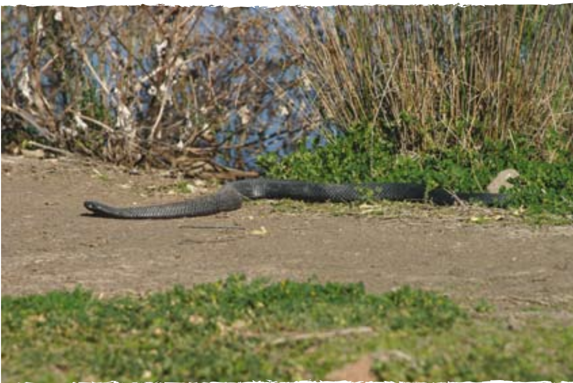
Pest, weed and land management protect native species in wetland areas, such as the red-bellied black snake.

As many NSW wetlands are located on private lands or affected by activities on private lands, land holders can improve wetland health by adopting good management practices. Controlling access by stock will help to ensure that wetland vegetation is not destroyed, and seed banks and soil structure are not adversely affected. In riparian areas, controlling stock reduces the amount and concentration of nitrogen entering streams, thus protecting downstream water quality. In coastal areas, preventing damage to mangrove and saltmarsh helps maintain their capacity to function as nurseries for juvenile fish.