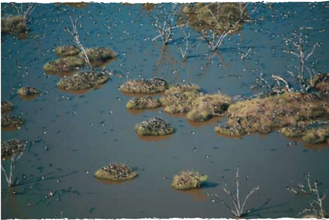
When wetlands are sustainably managed, they provide valuable habitat. Here, birds are breeding in the Macquarie Marshes.

For the sustainable management of wetlands, the NSW Government will adopt the following principles to guide decision-making: