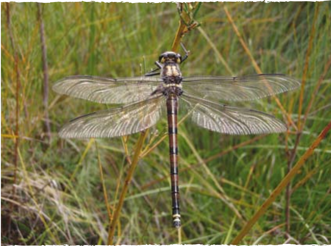
Wetlands are home to threatened species such as the endangered giant dragonfly Petalura gigantea , which is dependent on groundwater.