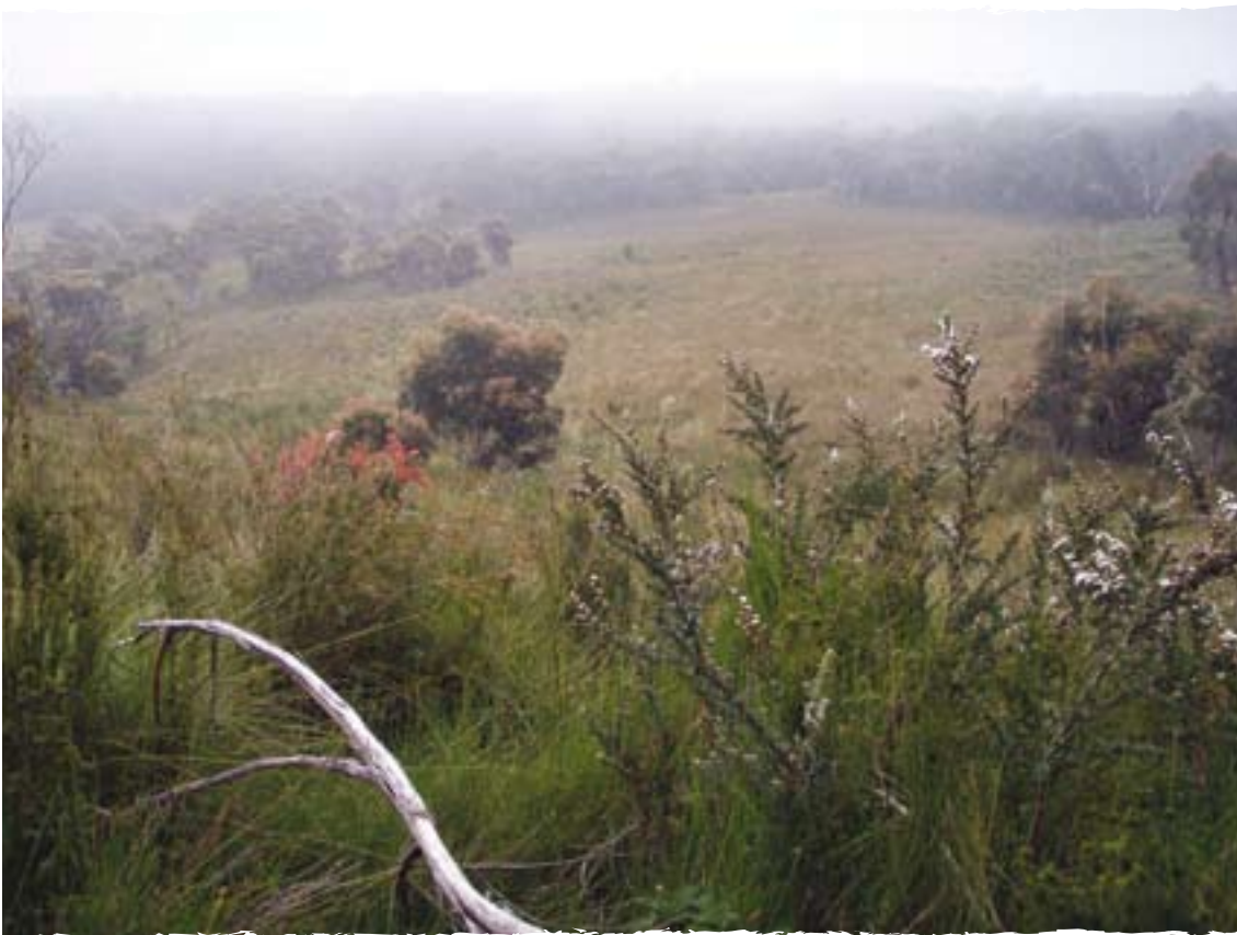
Monitoring management actions for wetlands will help to maintain and rehabilitate valuable areas such as this upland swamp.

Indicators will be specific to wetland types and will be selected based on conceptual models that illustrate ways in which wetlands might be expected to change in response to improved management. The indicators were trialled in one inland and one coastal region during 2008, and will be expanded to other areas of NSW in 2009–2010, depending on available resources. The Department of Environment, Climate Change and Water (DECCW) will be responsible for the program’s design and implementation.