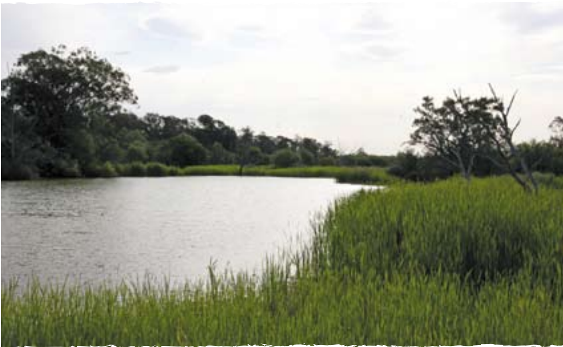
Environmental water is being directed to Gwydir Wetlands.

Inland wetlands include floodplain lakes and lagoons, reed swamps, woodlands and arid wetlands. For many of these wetlands, implementing environmental flows through the water planning framework was intended to halt and reverse wetland decline. The water sharing plans gazetted since 2004 have given environmental flows a legislative base, setting aside water for the environment (planned environmental water), allowing for adaptive environmental water licences, and establishing advisory groups to identify important ecological assets and guide environmental water management.