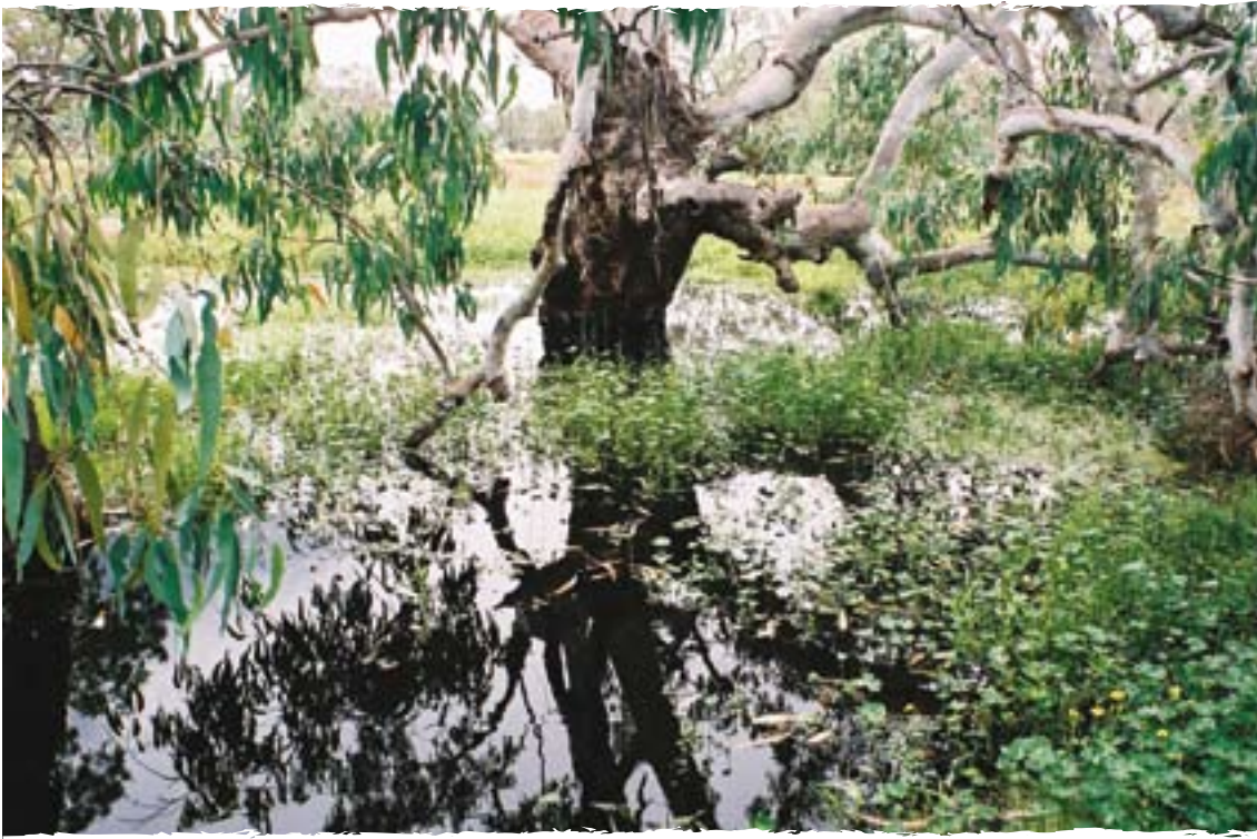
Wetlands provide valuable habitat for several eucalypt species, including river red gums.

Wetlands are dynamic living entities, and an important part of the natural environment. All wetlands are integral to landscape processes such as nutrient cycling, detention and slow release of flood water, and trapping of sediments. Wetlands form a vital component of regional and national biodiversity by providing habitat for a wide range of animals and plants.