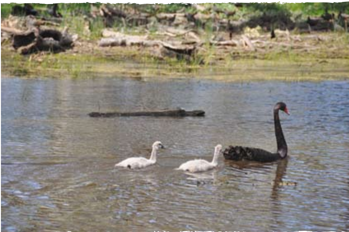
Waterbirds on the Lowbidgee floodplain provide nutrients to areas used for organic farming.

Supporting services relate to the support wetlands provide for ecosystem function, many of which are easy to overlook but all of which are vital. For example, clean water and productive fisheries are sustained by a wetland's capacity to assimilate nutrients and pollutants. Atmospheric carbon is cycled through the food chain and may be sequestered in the long term, particularly in peatlands which globally are one of the largest sinks for greenhouse gases.