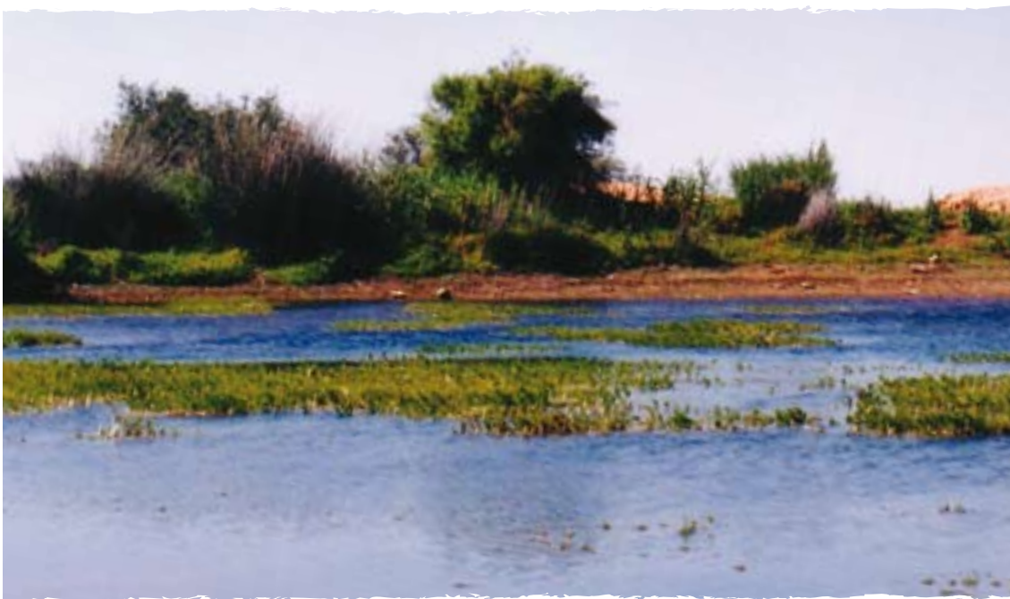
Coastal wetland in northern NSW.

See the introduction to this section (section 1.3) for further land use planning information including information on State environmental planning policy no. 14 – Coastal wetlands .