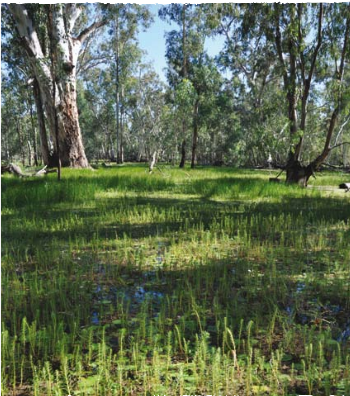
After delivery of 7,000 megalitres of environmental water to Yanga National Park between October 2009 and January 2010, vegetation flourished.

Wetlands cannot be managed sustainably unless people understand how they function. Research needs to identify the most achievable solutions for maintaining wetland integrity at catchment and landscape scales.