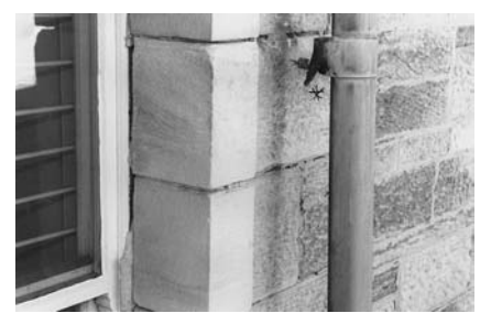
Loose fixings.

It is theoretically possible to have copper guttering (more noble) to a galvanised steel roof (less noble) as long as the two metals are not in direct contact. However, such a combination is risky, as a wet leaf or twig jammed between gutter and roofing can make electrical contact between the two metals and lead to corrosion of the steel.