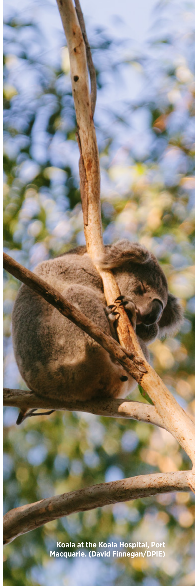
Koala at the Koala Hospital, Port Macquarie.

ISBN 978-1-922431-22-6; EES 2020/0232; June 2020