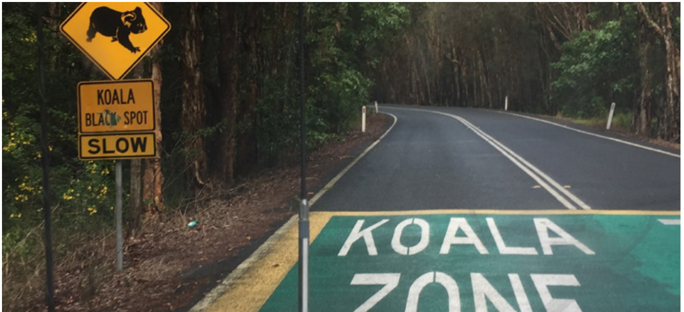
Figure 1 An identified koala vehicle strike ‘hotspot’ in the Tweed Local Government Area. (Sandpiper Ecological)