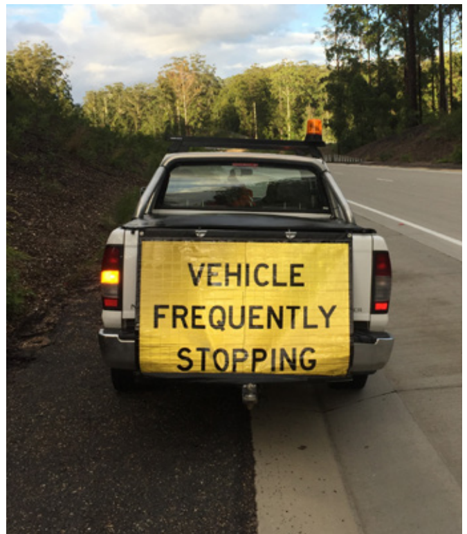
Figure 3 Warning sign on the back of a vehicle conducting wildlife vehicle strike surveys along the Pacific Highway.