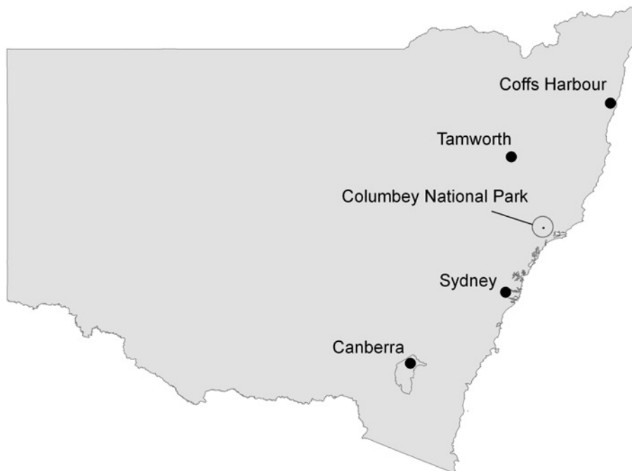
Map 2. State Location Map

As well as the park, the area subject to this plan includes Eagleton Road which is vested in the Minister under Part 11 of the NPW Act, to ensure a continuation of access arrangements to neighbouring private land (refer to Map 1).