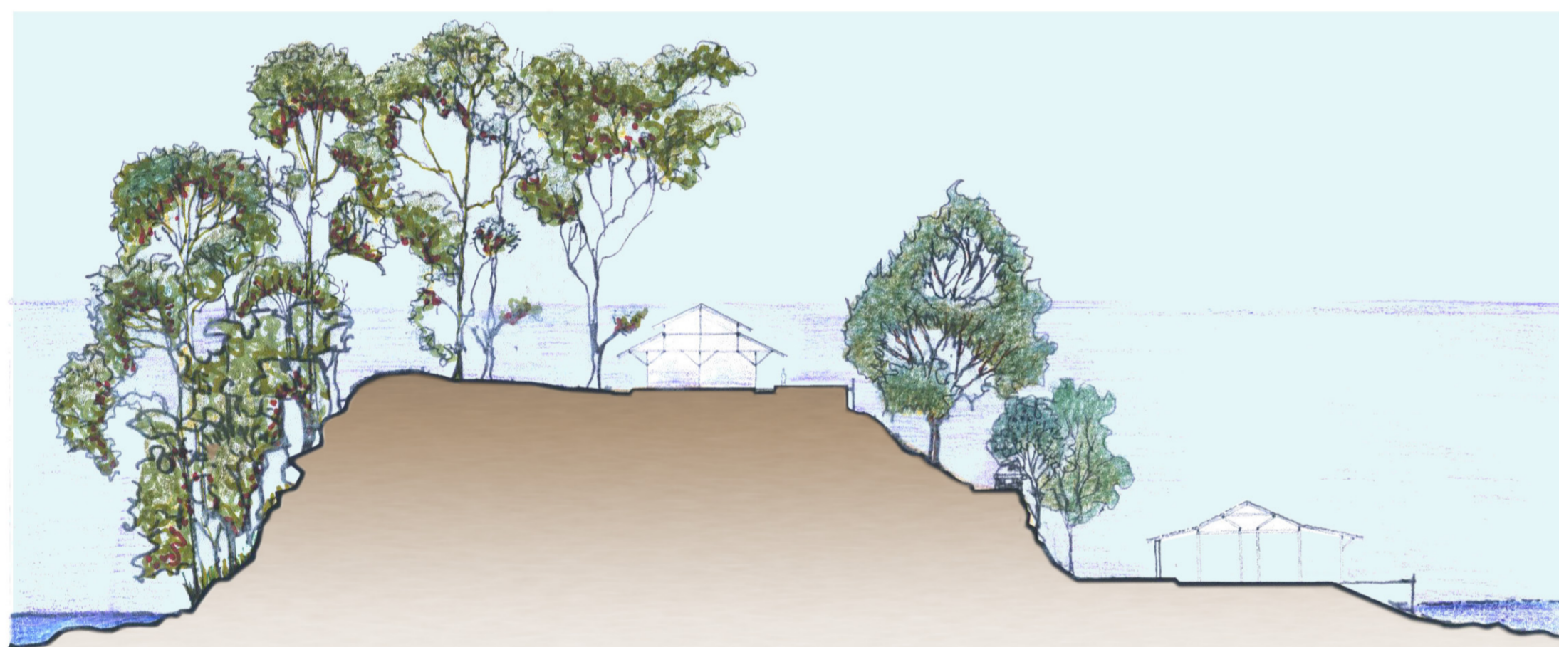
E Allambie Ridge showing proposed pavilion and enhanced boatshed