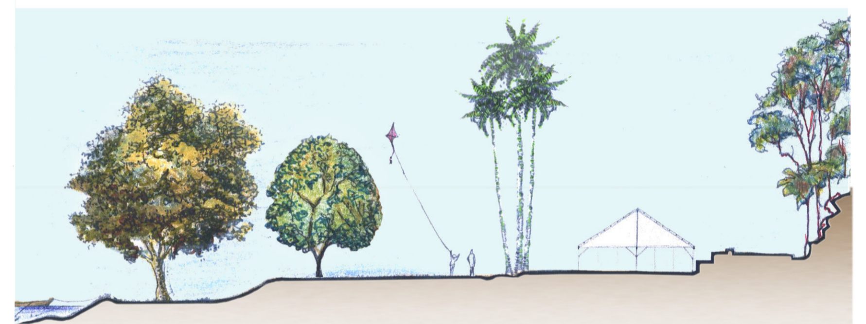
D Section through Pavilion Flat with Commonwealth Pavilion