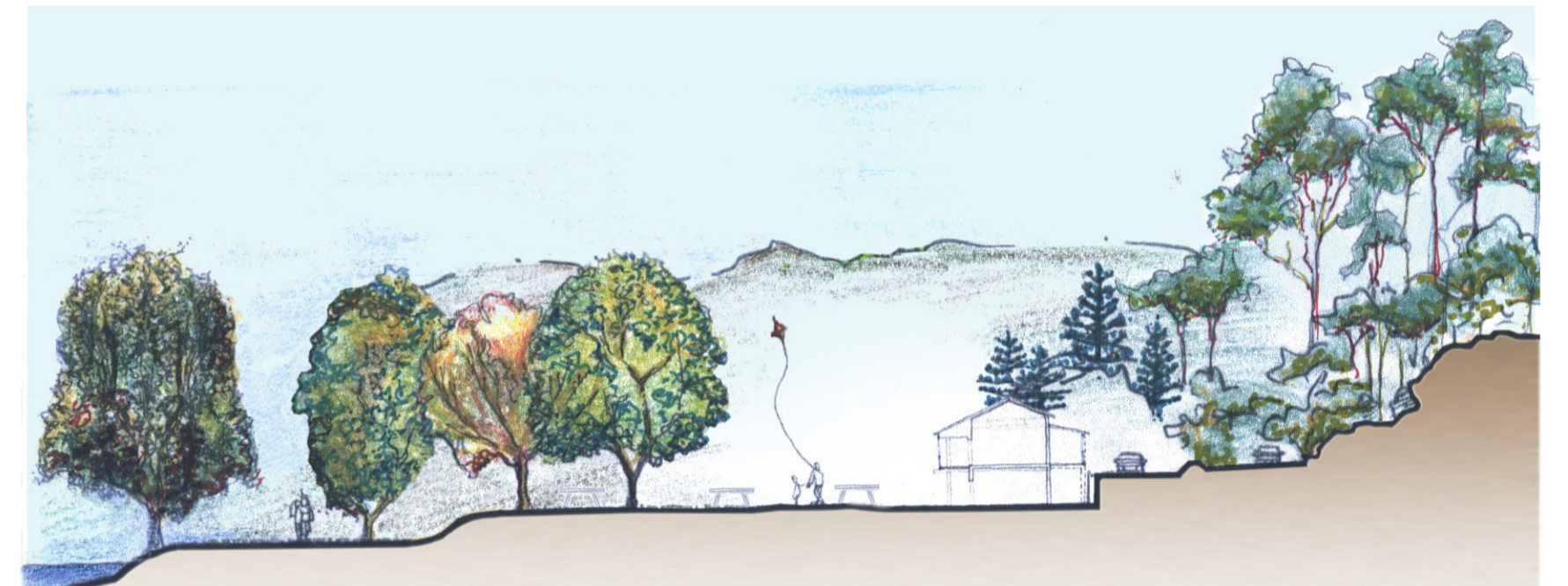
C Section through Dance Hall and proposed kiosk on Pavilion Flat