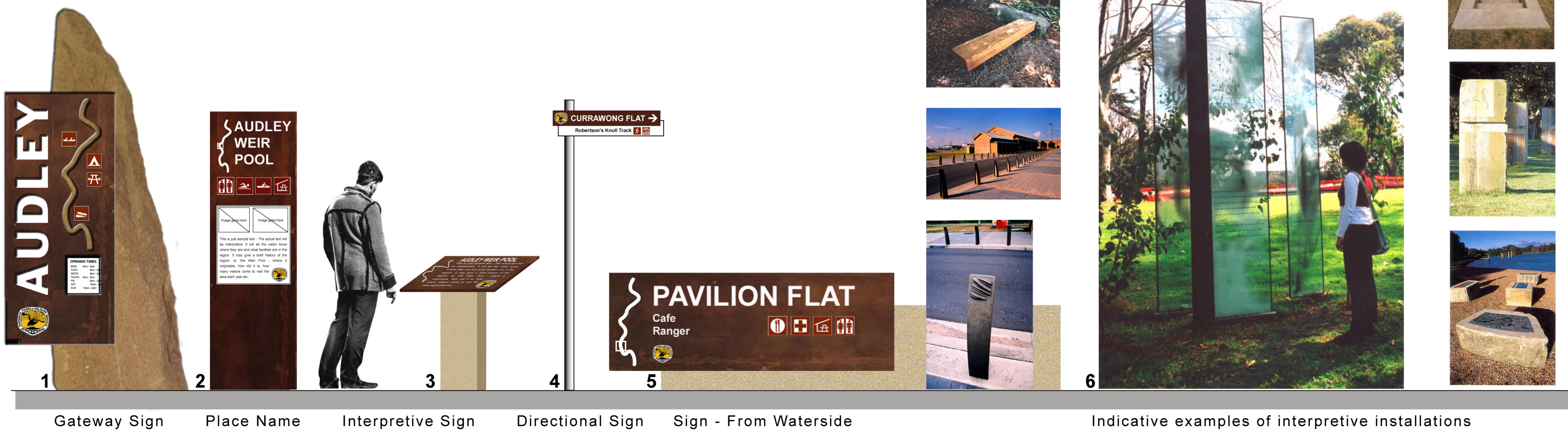
1 Gateway Sign