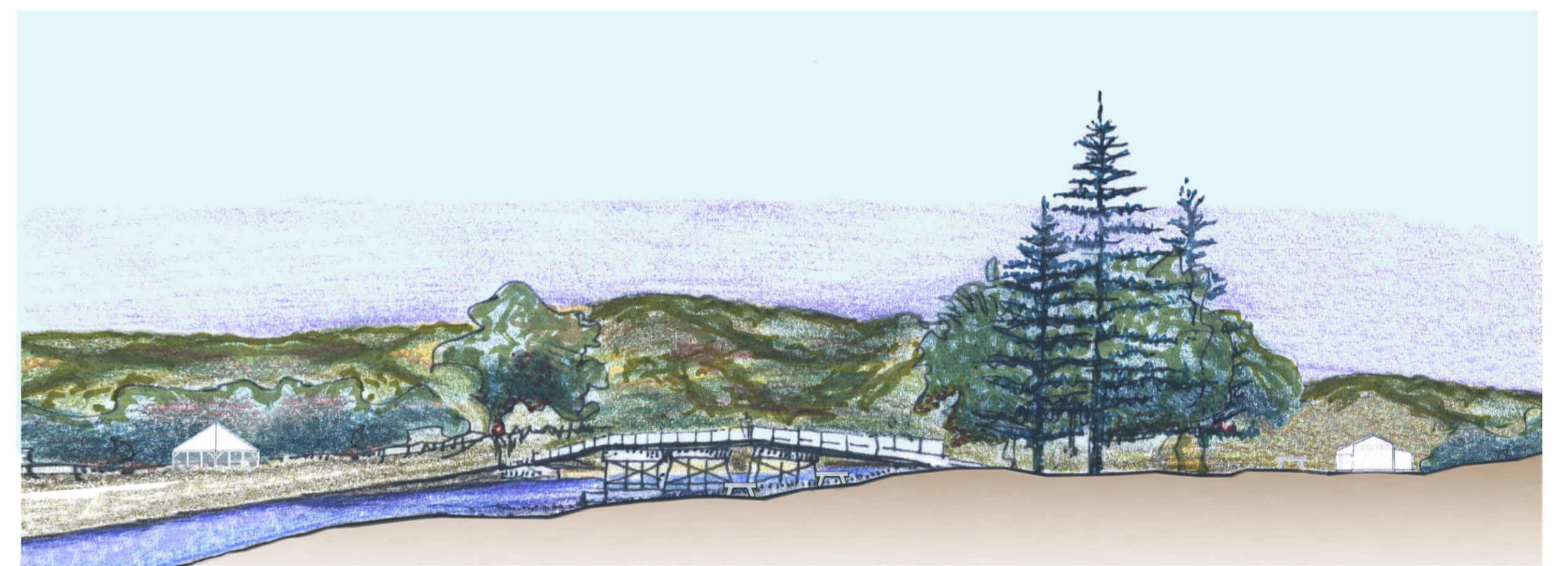
F Picnic area, Currawong Flat