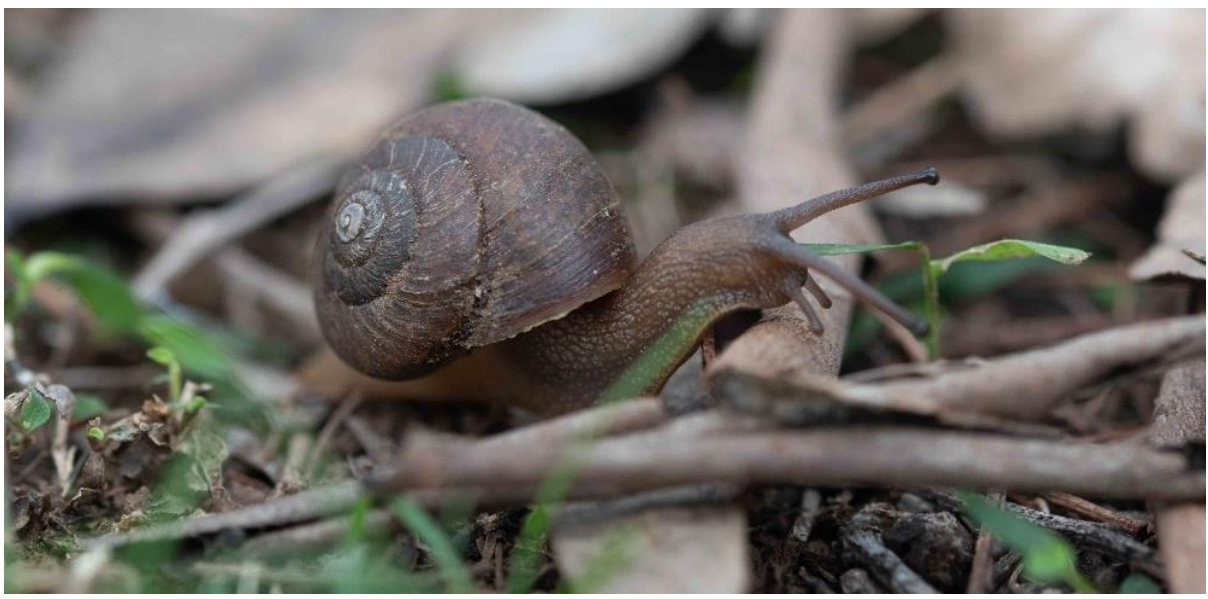
Cumberland Plain Land Snail, Meridolum corneovirens inhabiting the Cumberland Plain Woodland in the Sydney Basin Bioregion.