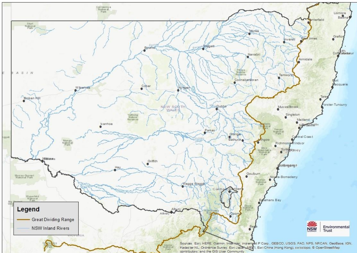
Figure 2: Project eligibility area; NSW inland rivers which are west of the Great Dividing Range.

Projects must be located within NSW inland river catchment or sub-catchment areas i.e. west of the Great Dividing Range (Figure 2).